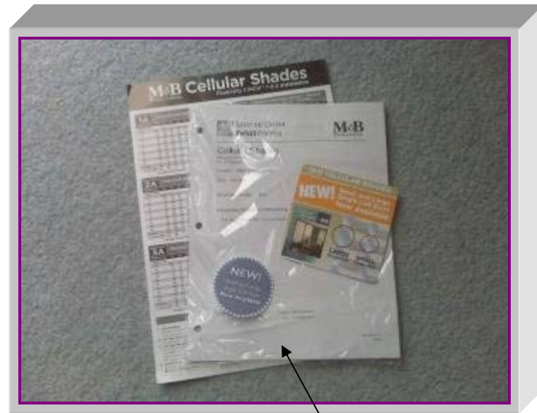
M&B Kit Contents