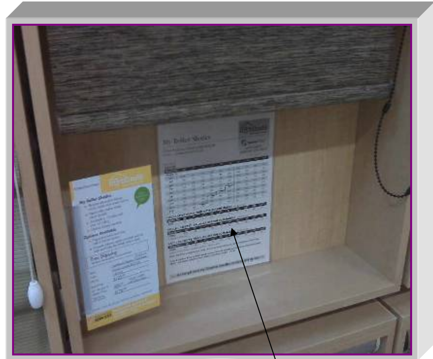
Existing Price Chart