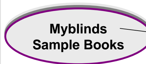
Myblinds Sample Books