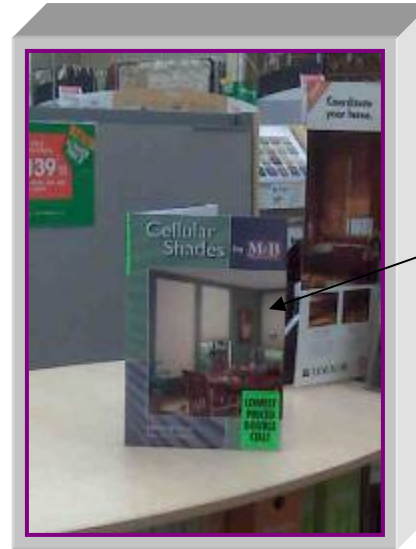
Cinch Sample Book