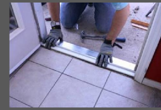
Slide into place