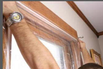
Apply film to window