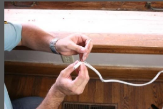
Peel back paper