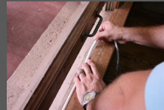
Stick to window frame