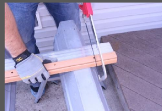
Cut door seal to fit door