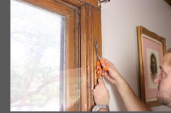
Trim excess film