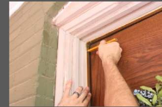
Mark holes through seal