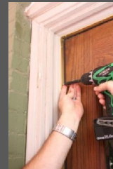
Screw seal to door frame