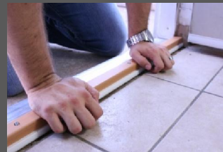
Snap cover in place