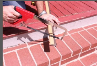
Cut sweep to fit door