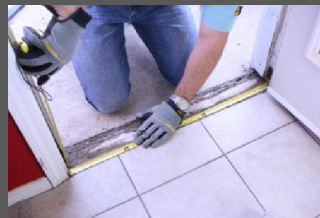
Measure width of door