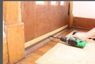
Screw sweep to door