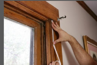
Apply tape to window frame