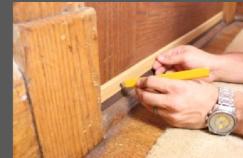
Mark holes on door