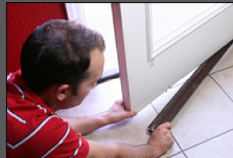
Remove door bottom