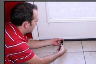
Screw bottom to door