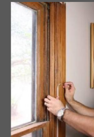
Peel back paper