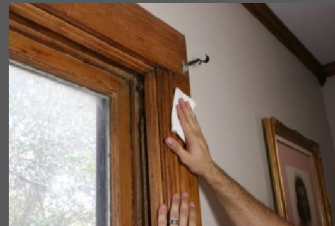
Wipe surface clean