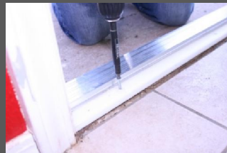
Screw down threshold