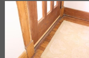
Trim excess film