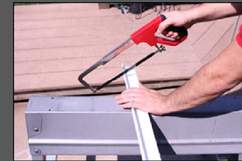
Cut door bottom to fit door