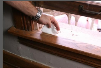
Wipe surface clean