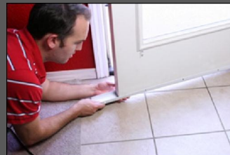
Drill pilot holes