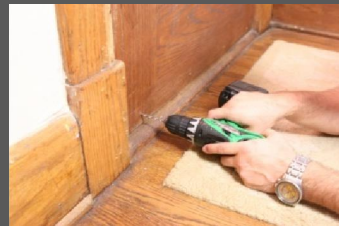
Drill pilot holes