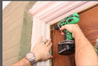
Drill pilot holes