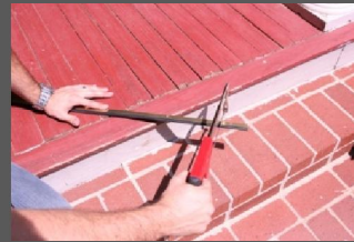
Cut door seal to fit door