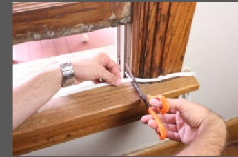
Cut tape to fit window